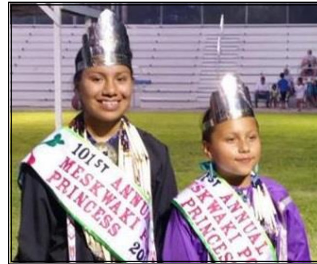
102nd Annual Meskwaki Powwow Princess & Jr Princess

https://www.facebook.com/Meskwaki.Powwow